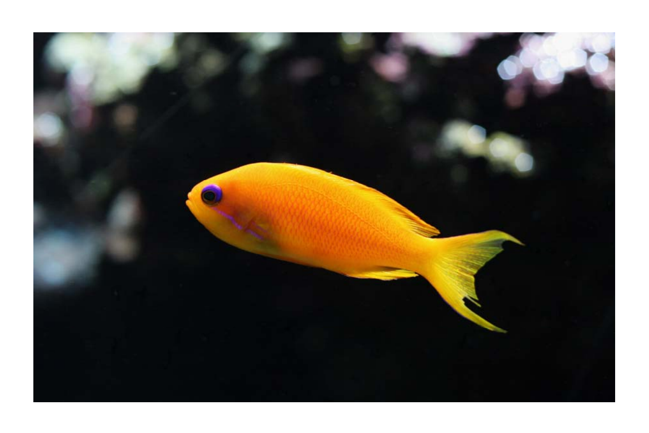
I see an orange fish.