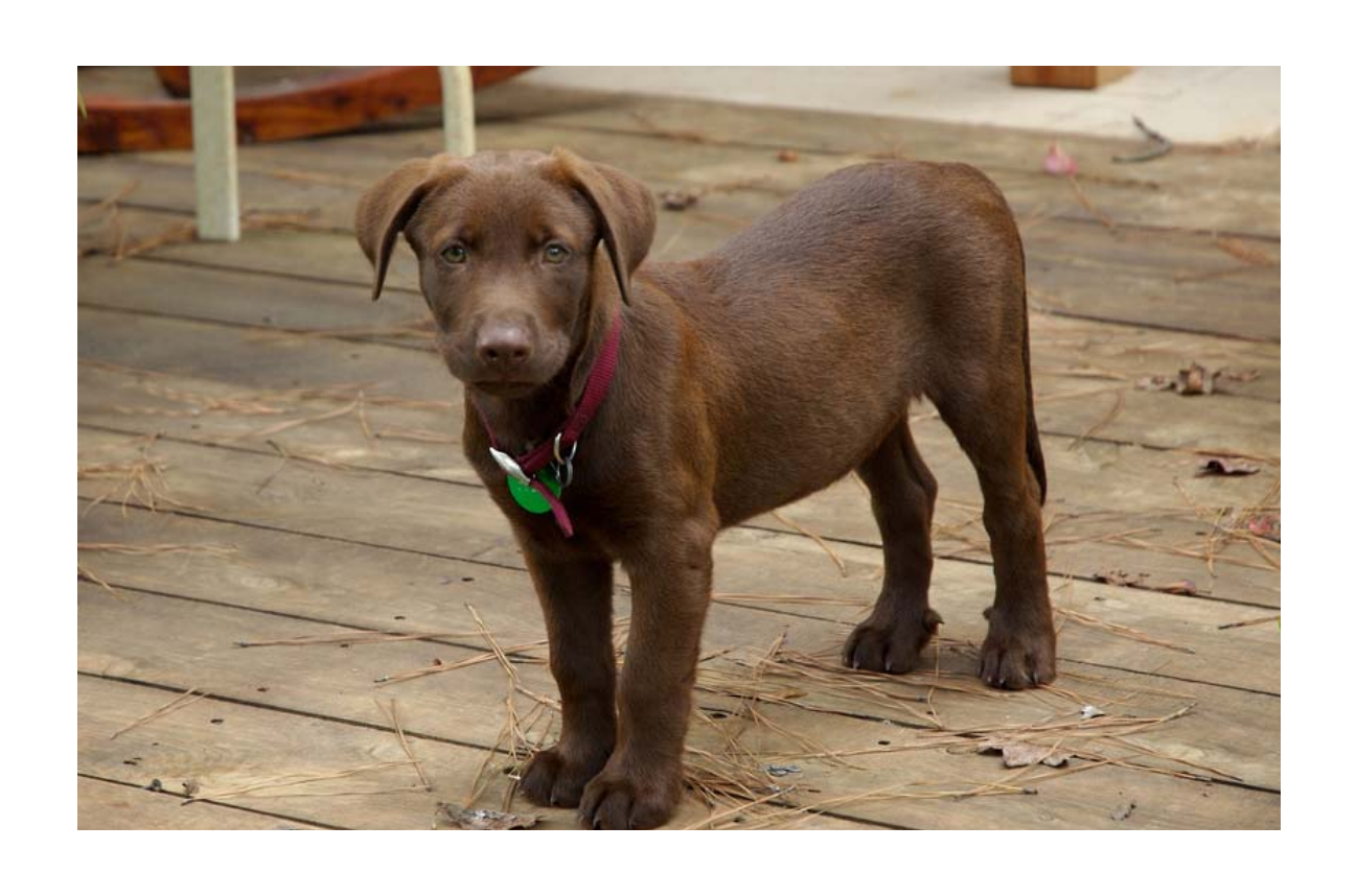
I see a brown dog.