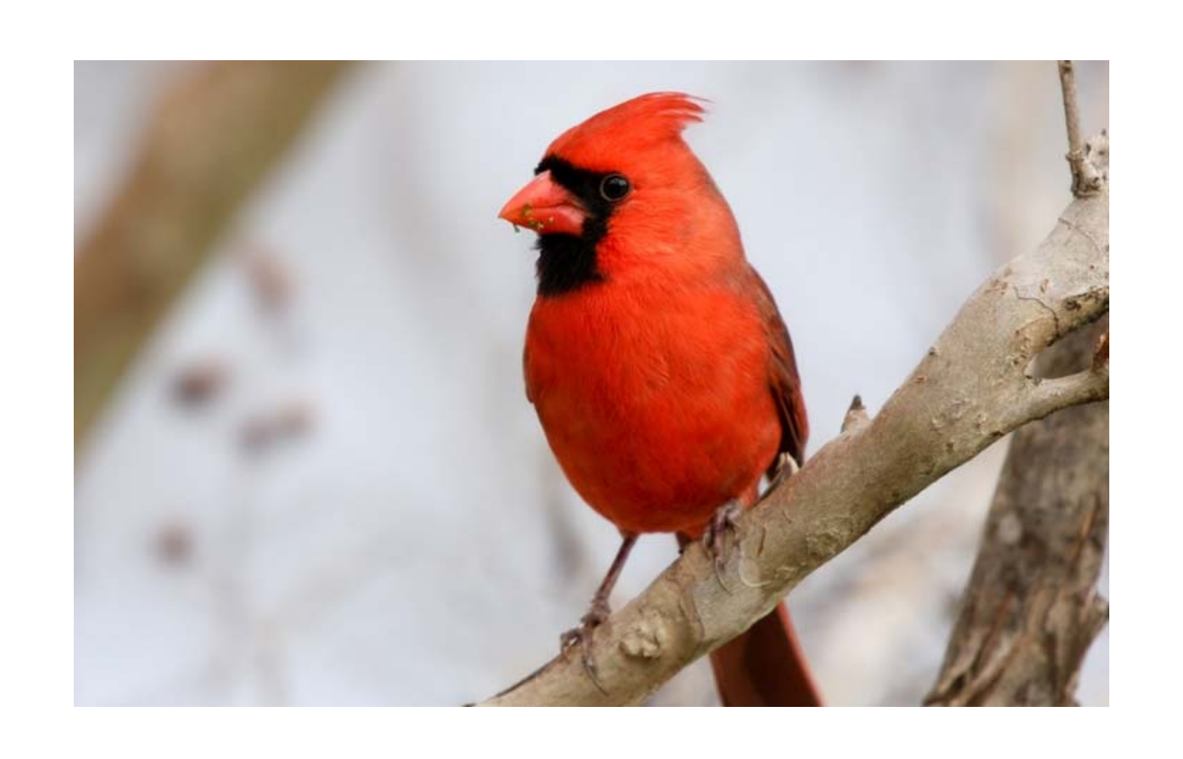
I see a red bird.