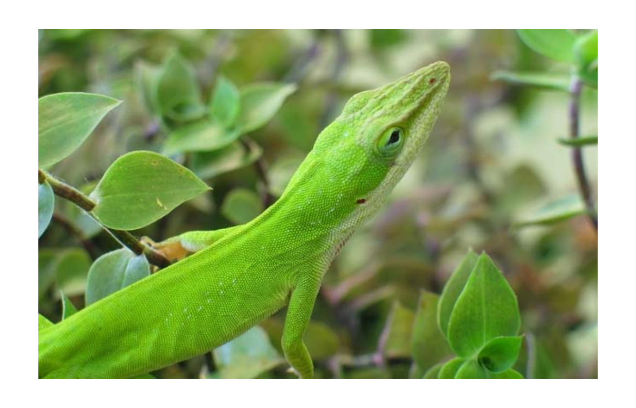
I see a green lizard.