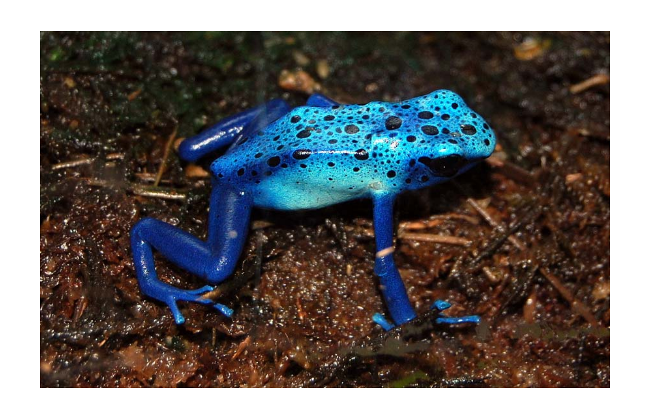
I see a blue frog.