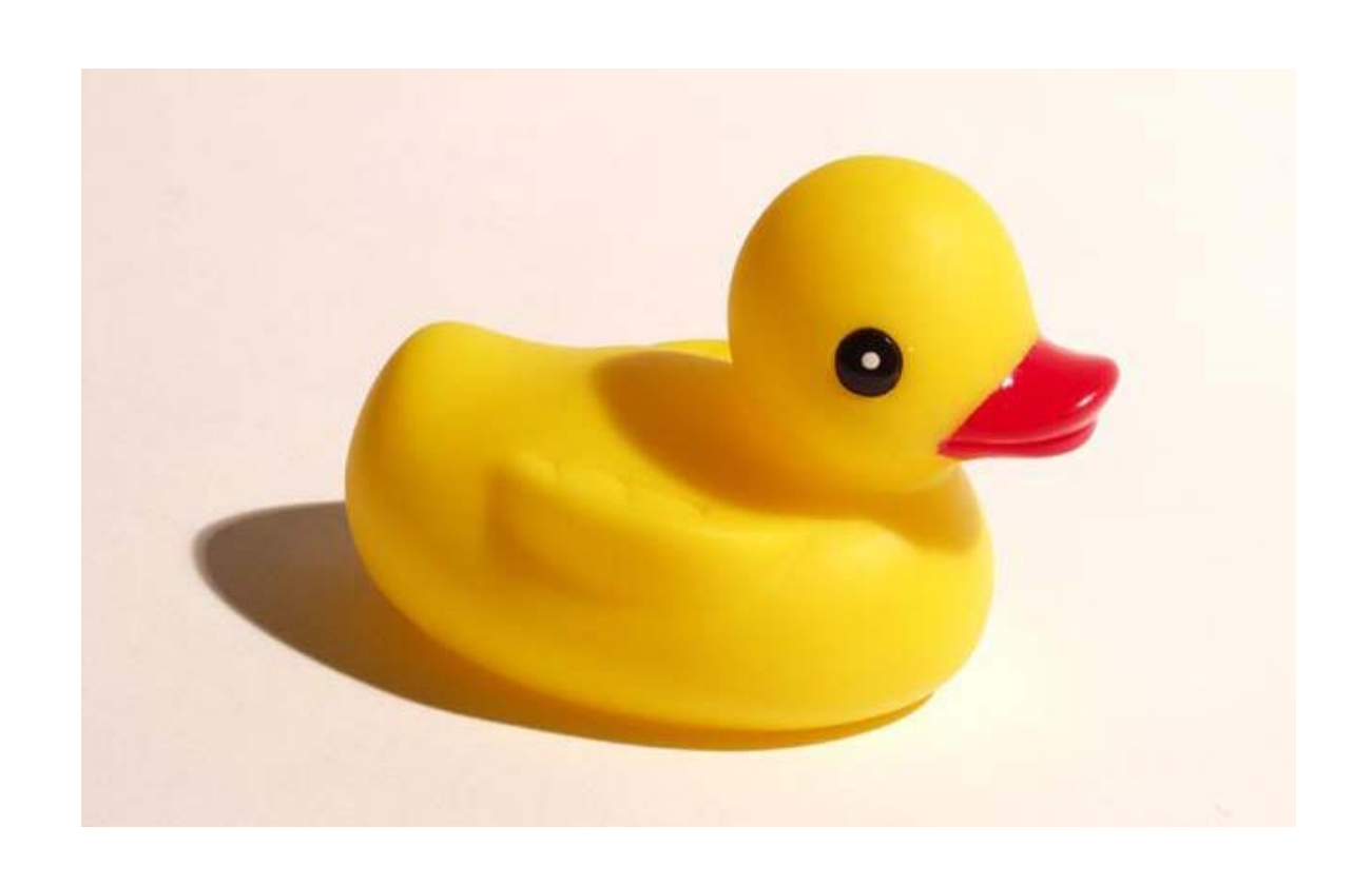
I see a yellow duck.