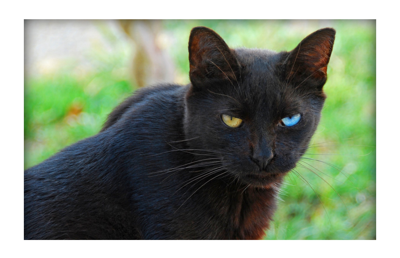
I see a black cat.